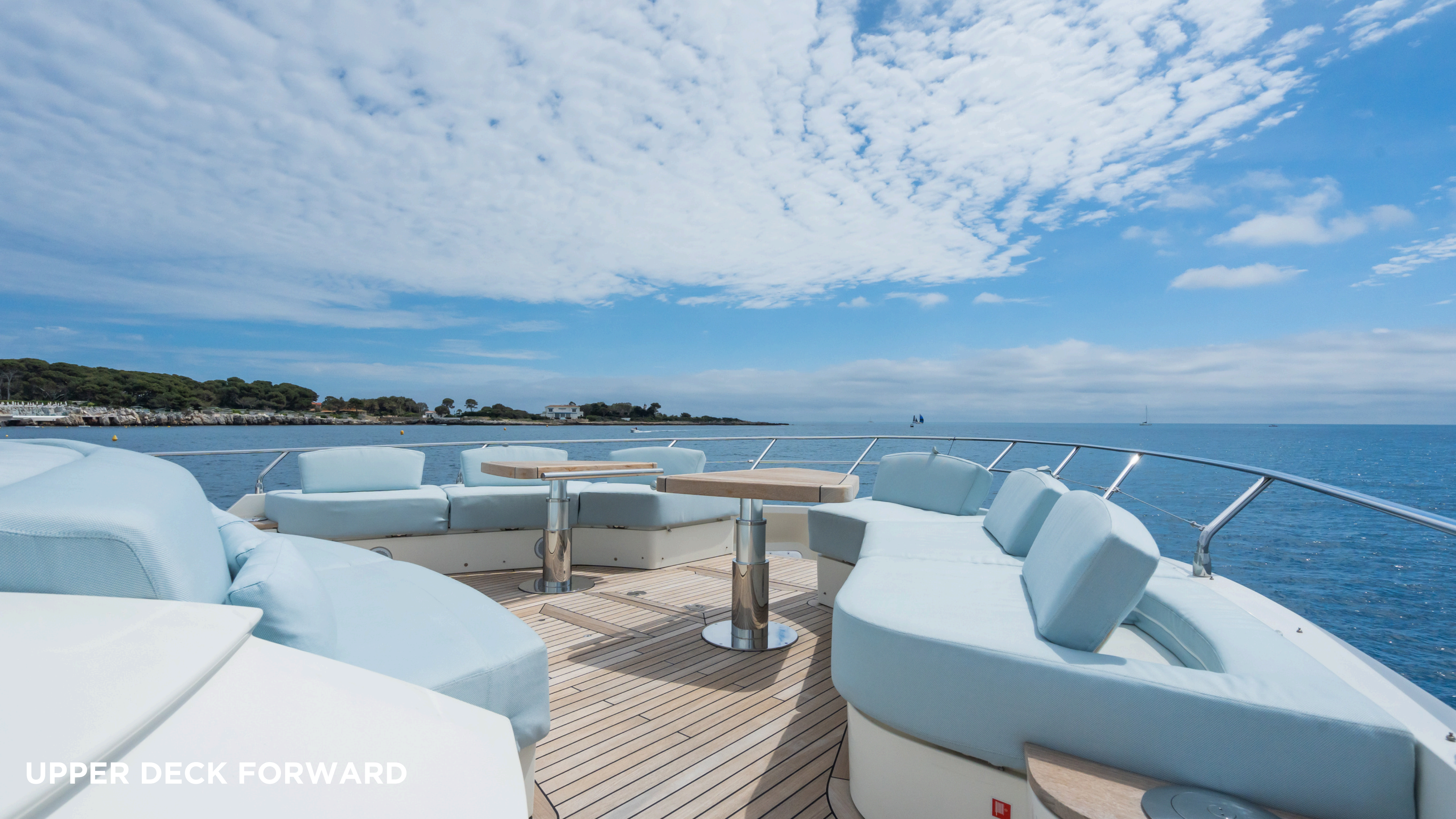
UPPER DECK FORWARD